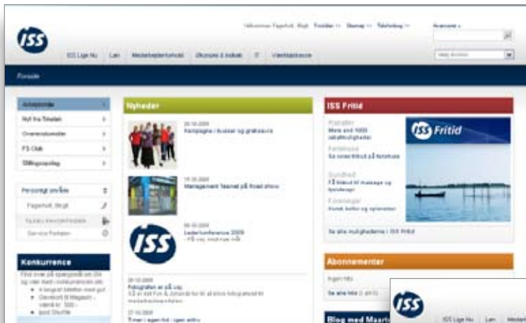
ISS Facilities A/S