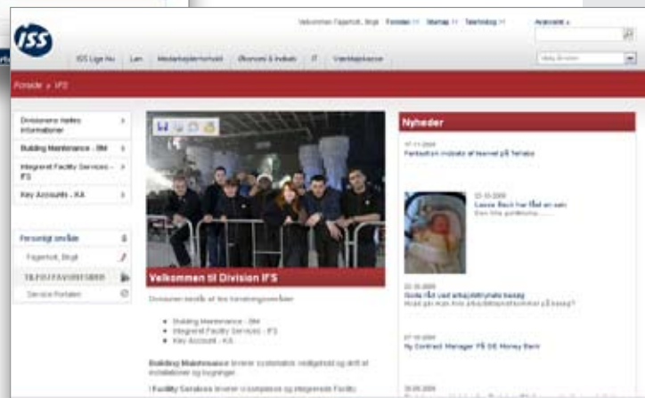
ISS Facilities A/S